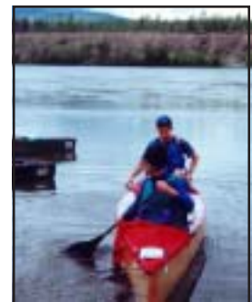
Harris & Horton 2000 5th place canoe at Carmacks checkpoint

Paddlers often need help to get out of their boats after a day of non-stop paddling. The 40 hour cut-off is required as it is very difficult for organizers to find enough volunteers to cover the check point when there is such a long period of time between the first and last teams.